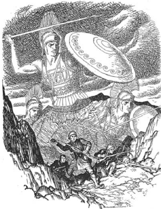
Figure 8.1 On October 28, 1940, following an Italian ultimatum, Greece refused to concede to Fascist occupation. The victory of the Greek forces against Mussolini's legions inspired the victims of Axis aggression in the darkest hour of Europe. Punch magazine celebrated Greek defiance with this cartoon

Finally, in January 1940, a definitive war trade agreement was signed between the two countries, as well as a shipping agreement, by which the Greek ship-owners undertook, with the encouragement of the Greek government, to provide Britain with 31 ships and to ensure that another 29 would be put forward, amounting to about 500,000 tons.